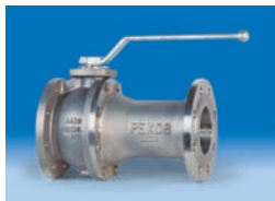
Split body floating