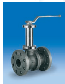
Metal to metal