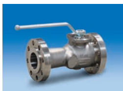
End entry floating