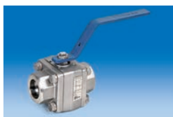
Three piece forged