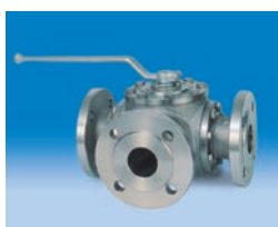
3 & 4 way floating and trunnion